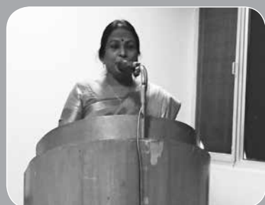
Chief Guest speaks on Alternative medicine Homeopathy