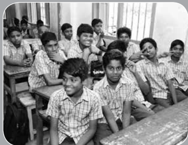
Student of Boys