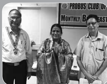
President and Secretary felicitates Chief Guest with Shawl