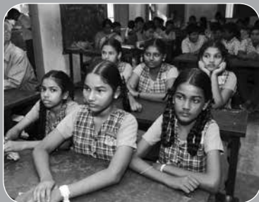
Student of Girls