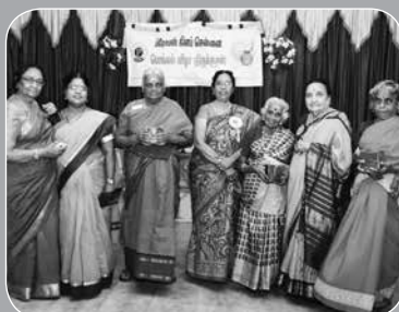
Vishranthi participants with Probud members